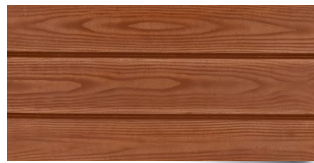
RED PINE (871)