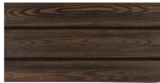
DARK WALNUT (873)