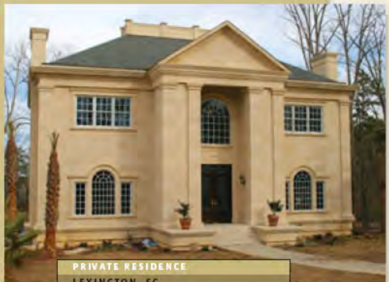
PRIVATE RESIDENCE LEXINGTON, SC

"I wanted something really special for my house, and I was so pleased with the results I got with the Dryvit Limestone product. People stop all the time to ask me questions about it, and they can't believe it's not limestone block on my house."