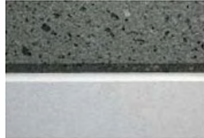
TERRANEO® & LIMESTONE

ON LARGER WALL SURFACES, EPS SHAPES AND AESTHETIC REVEALS ARE COMMONLY USED TO YIELD A REALISTIC LIMESTONE EFFECT.