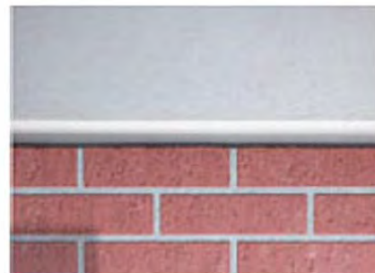
TERRANEO & CUSTOM BRICK™

LIMESTONE IS THE PERFECT FINISH ON WHICH TO APPLY DRYVIT TUSCAN GLAZE – RESULTING IN AN OLD WORLD PLASTER APPEARANCE.