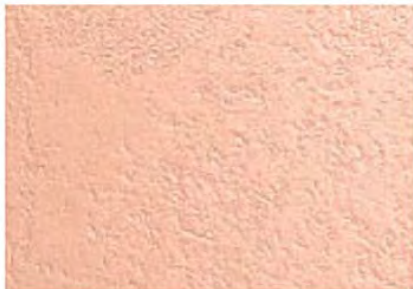
LIMESTONE TREATED WITH TUSCAN GLAZE™

THE SMOOTH LIMESTONE FINISH BEAUTIFULLY COMPLEMENTS DRYVIT TERRANEO – THE REVOLUTIONARY FINISH THAT USES MINERALS AND MICA TO YIELD A HIGHLY REALISTIC GRANITE LOOK.